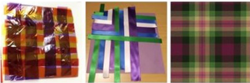
Figure 2. Tartan design creative process (left to right: acetate, ribbon and digital prototypes).

In recent years, the make up of co-design participants has evolved to ensure that those who will be affected by the design have a say in the process, rather than being just final users (Ehn 2008; Tunstall 2013). Today, participants are considered to be able to bring valuable