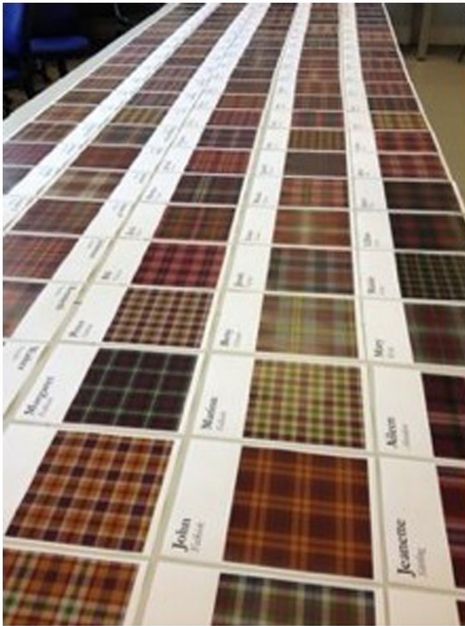
Figure 4. Over 130 designs for the new disrupting dementia tartan (judging and short-listing session).

Next, digital versions of the 7 short-listed tartans were uploaded and exhibited on the Alzheimer Scotland website— http://www.alzscot.org —for people to vote for their favourite tartan design. After more than 8000 votes were cast from across Scotland, the chosen Disrupting Dementia tartan was designed by Nan from Inverness. Nan's winning design has now been manufactured and the plan is to develop a range of tartan design products that will be sold all over the world (Figure 5). This project shows clearly that a person living with dementia has, with a little support, designed a new product—the new Disrupting Dementia tartan. As such, this co-design project goes to show that people with dementia can indeed offer much to society after diagnosis.