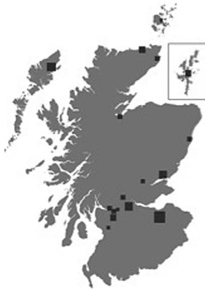
Figure 1. Disrupting dementia tartan co-design workshop locations.

In a co-design project such as this one, it is important that the designer does not take an overly dominant role. Typically, designers will embrace a supporting role in order to help the collaboration blossom. Ultimately, however, the goal is to achieve something like a symbiotic collaboration —a mutually beneficial relationship between different people or groups. Only when the participants get sufficient authority to determine and shape the project and the project's agenda, however, can a project be described as truly participatory. The instigator of the co-design project should be transparent about the project's objectives and clearly articulate the reasons behind embarking on a co-design project. In other words, the project rationale should always be known from both sides. Van Klaveren (2012) suggests such an ethical and transparent approach is the foundation for a truly symbiotic co-design relationship. However, the challenge of achieving such high quality co-design project participation is often not straightforward (Sanders and Stappers 2008).