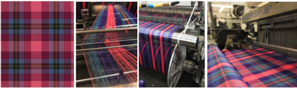
Figure 5. Production of the disrupting dementia tartan.

Reflecting on the co-design workshop sessions with more than 130 people living with dementia, it is abundantly clear that people living with dementia can offer much to society after diagnosis. On completion of the co-design project, a questionnaire was sent to