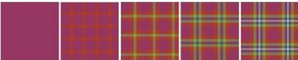
Figure 3. Co-creating the digital tartan prototype step-by-step.