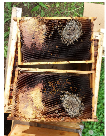
Figure 1. A lost honey bee colony after winter 2016/17 showing sealed honey stores, bee bread and remains of a small winter cluster of bees (all dead).

The COLOSS monitoring year starts with the workshop in February, followed by the data collection period (Figure 2). The survey is comprised of questions on the