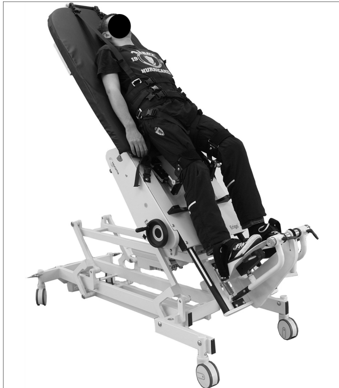
Figure 1. Tilt-table with integrated robotics-assisted stepping device (Erigo, Hocoma AG; Switzerland).

placed over the quadriceps ( 5 \times 10 cm oval), hamstring ( 5 \times 10 cm oval), and calf ( 5 \times 6.4 cm oval) muscle groups. Stimulation frequency and pulse width are fixed at 20 Hz and 300 \mu s, respectively. Stimulation current is adjustable for each individual muscle group. Stimulation timing is automatically synchronized during stepping by the RATT device via integrated position sensors that continuously measure the angular positions of the robotic orthoses. In this way, we know when flexion/extension of the hip/knee joints occurs during stepping. The hamstring and calf muscle groups are stimulated during knee flexion, and the quadriceps muscle group is stimulated during knee extension.