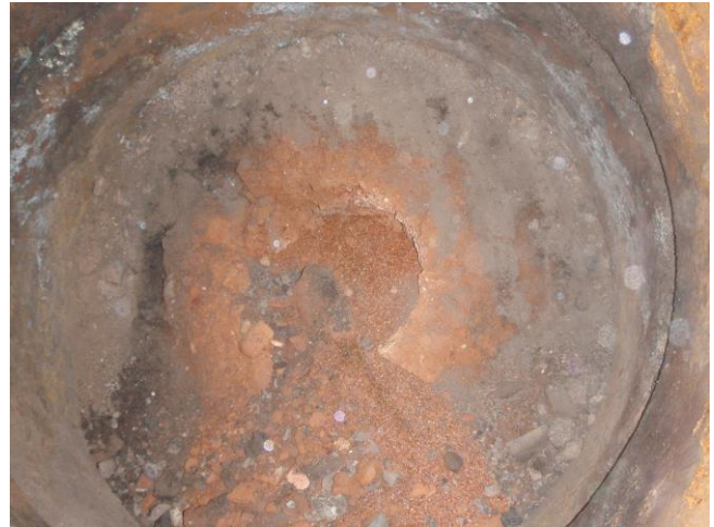
Figure 1. Smouldering remediation of coal tar in made ground. This is the top view into the excavation of a horizontal air injection experiment. The sharp transitions from remediated material in the centre to material that was unaffected by the process are evident, particularly on the left-hand side.

A sample of sand was set aside for analysis before