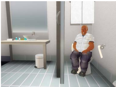
Figure 2 Avatar exploring virtual aloft hotel bathroom.

Another initiative of the company in Second Life was to create a competition where avatars were asked to provide ideas for improvement of the hotel design. The competition winner received the Virtual aloft island as a prize. The hotels that were subsequently built implemented most of the recommendations that had been received in Second Life. The company also used an indirect way to get feedback from the virtual world presence through monitoring the way that Second Life residents moved inside the hotel. For instance, it was possible to see to which areas of the hotel that avatars preferred to go to and which furniture they found attractive. Brian McGuinness, VP of Starwood Hotels, said during the period these experiments were conducted that one positive outcome of creating a virtual hotel is that money is saved by not having to build features in the real world that virtual visitors have disliked (Jana, 2006).