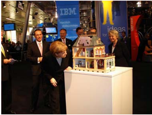
Figure 1 EOLUS physical dollhouse with two way links to a Second Life counterpart