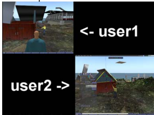
Figure 3 PARC ‘garden’ task. User1 verbally directs User2 to build within the virtual world

Throughout the experience, the participants adopted organisational structures that precluded the need for fine-grained collaboration, possibly because the articulation work required for close collaboration represented too high a load. Most of the working groups decomposed the house into “base” and “roof” subassemblies, completed in a separate manner and joined later. The necessity to achieve a specific goal which was rather complex (building the house or garden) moved the working structure towards decomposing the project into sub-tasks that allow specialisation and independence from synchronicity. The need for coordination to integrate the final results also became clear in both experiments.