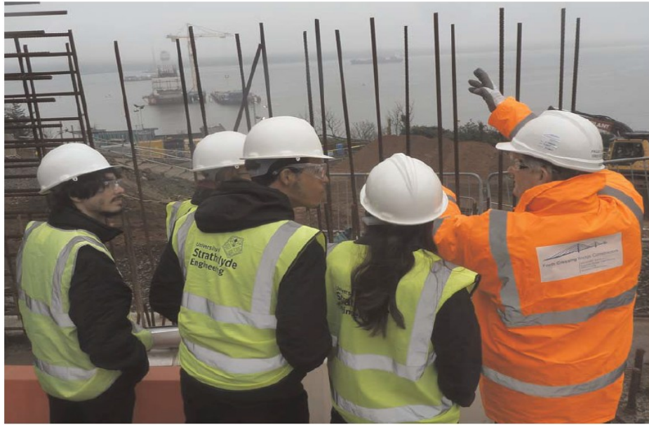
Figure 2. Mentoring (contractor)