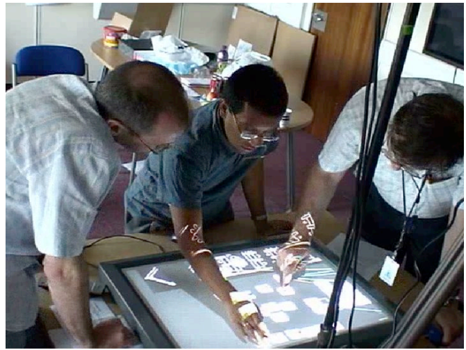
Figure 1. The study setup and DiamondTouch surface. Left: a group working in the mouse condition. Right: A group working together in the touch condition

told what they had to do in the task. The experiment concluded with a debriefing session.