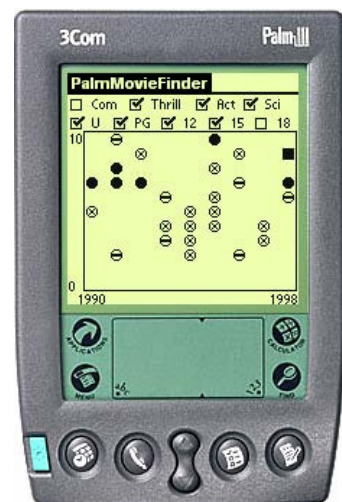
Figure 1: Sample screen

The experiments were based on Ahlberg and Shneiderman's FilmFinder [1] example. A PalmOS version of the FilmFinder was developed: PalmMovieFinder . Coloured blocks from the original were replaced by monochrome 8x8 icons depicting the different film categories (comedy, thriller, action or sci-fi) with a full block-icon (■) representing more than one film on a display cell. Films were also categorised by rating certificate (using the UK scheme: U, PG, 12, 15, 18), these categories were not mapped onto the main display. Finally, the movies' year of release and current popularity rating [3] were used as X- and Y-axes. Figure 1 shows a sample screen with all non-18 certificate non-comedies selected. To open an item the user taps on the icon, if a block-icon is selected the information for all movies in that cell is shown. To allow users to focus on a subset of the data, a simple zooming strategy was adopted: on pressing the scroll button, the display is split into 4 zones with a subsequent tap zooming into that zone.