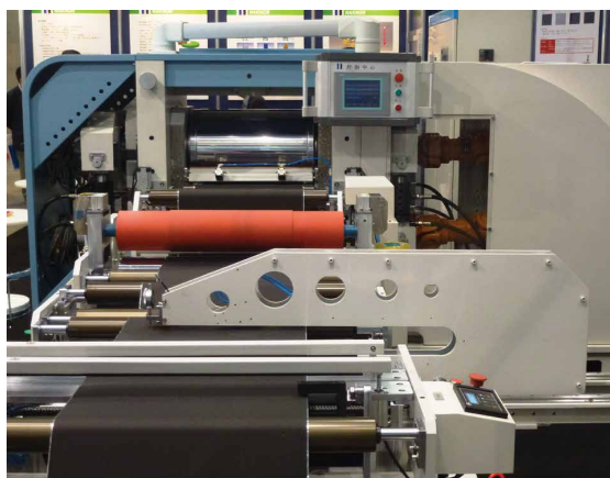
Fig. 4. Calander (pressing) machine for lithium-ion battery electrode manufacturing.

Fabrication called for finicky quality control and sophisticated production tools and instruments (Fig. 4). Whereas producers of electronics commodity cells sought to weed out defective cells at the end of the manufacturing process