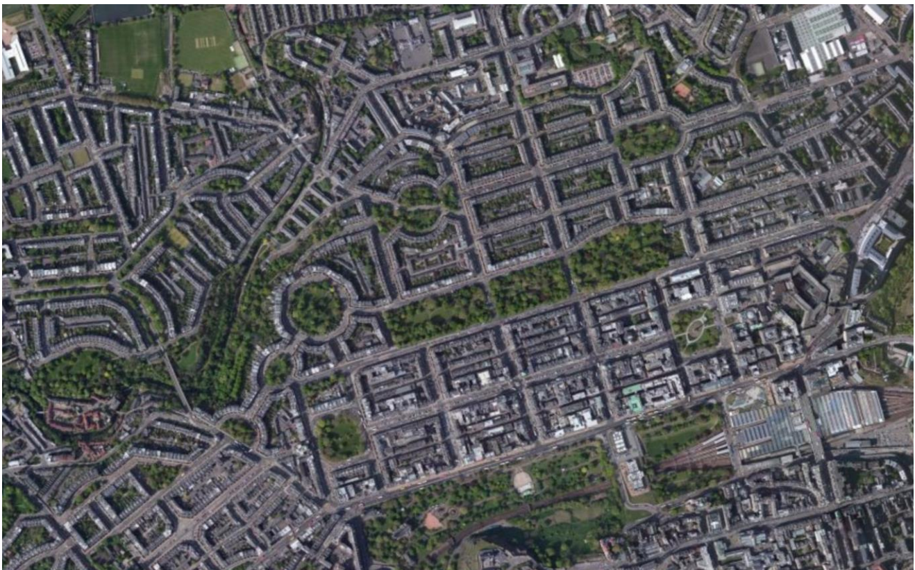
Figure 2. New town plan for Edinburgh, 1767, the largest masterplanning project in the country at the time. The overall layout was drawn by Architect James Craig, whilst individual parcels were acquired by different feuars (individuals holding a feudal tenure of land) often simple tradesmen, masons and wrights, and built by different independent developers and architects. Over time, whilst keeping its majestic character and overall structure, Edinburgh Town has shown a remarkable capacity to host new functions and accommodate the needs of new users.