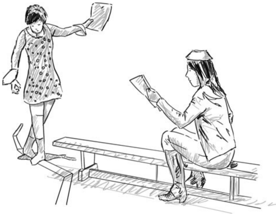
[Figure 2: Tracing the sticky tape trail]

She turns around and looks directly at the audience/ into the camera. Her smile seems forced and her lines resonate her still lingering anxiety: After that I still felt very uncomfortable. I can't stop thinking 'what if...' something happens, what am I doing?