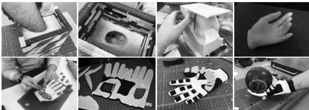
Figure 1. The Prototyping Process of a Sports Engineering Student

This study was performed through the review of individual student projects in the Department of Design, Manufacturing and Engineering Management at the University of Strathclyde. The course's objective is the delivery of a product that represents a solution to a design problem, as seen in Figure 1. Students have been specifically encouraged by their instructors regarding the importance of prototyping and modelmaking at all stages of the design process, with a more specific focus on early exploration stages. The course is divided into Stage 1 ending in December and Stage 2 ending in May of the academic year. Initially, 133 student projects were reviewed, however that number was later reduced to 120 as 13 of the projects did not include a prototype or a physical model, according to our used definition. The total of 120 examined projects have been undertaken by both 4 th and 5 th year students of 3 courses; 68 in Product Design Engineering (PDE), 26 in Sports Engineering (SE) and 26 in Product Design and Innovation (PDI) and all of them were anonymised prior to the initiation of the study.