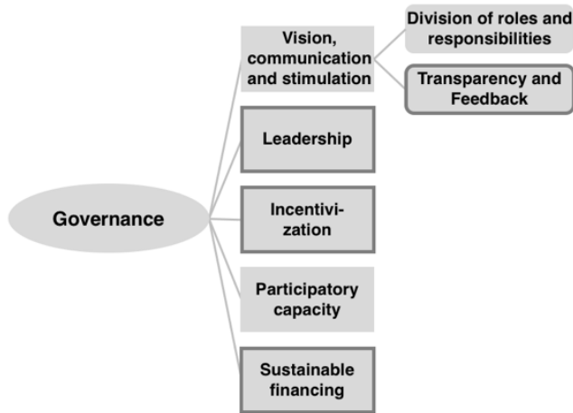
Figure 2: Governance criteria after empirical validation

ecosystem approach has so far mainly been applied in the research domain of open data. However, the issue in the humanitarian sector is that much data is not shared openly, and sometimes not even stored digitally. The question to be answered was therefore: should these same criteria be considered when establishing a data ecosystem in the complex, fragmented humanitarian context around the Community Risk Assessment and Prioritization toolbox developed by the Netherlands Red Cross?